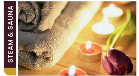
STEAM & SAUNA